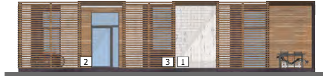
ELEVATION 3 SCALE 1:200