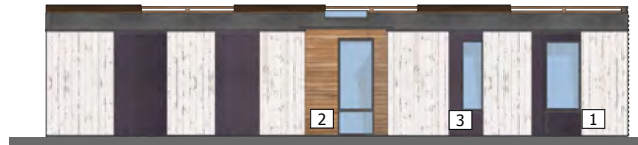
ELEVATION 4 SCALE 1:200