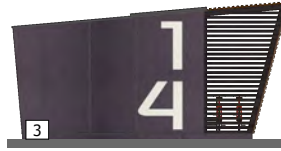
ELEVATION 2 SCALE 1:200