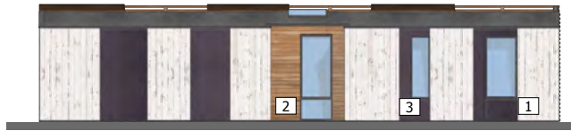
ELEVATION 4 SCALE 1:200