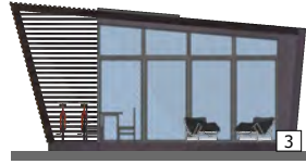
ELEVATION 1 SCALE 1:200