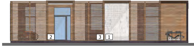
ELEVATION 3 SCALE 1:200